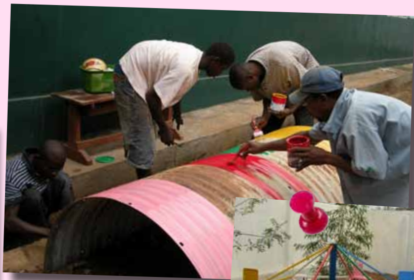
Creating a playground for the children