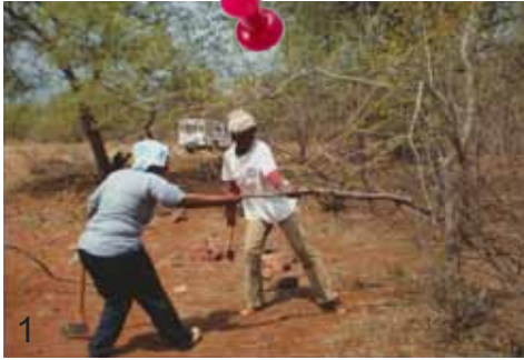
1 Sefhare women, cutting branches in the bush. The branches needed to make fences around the home and, more importantly, the vegetable plots to keep out goats and donkeys.