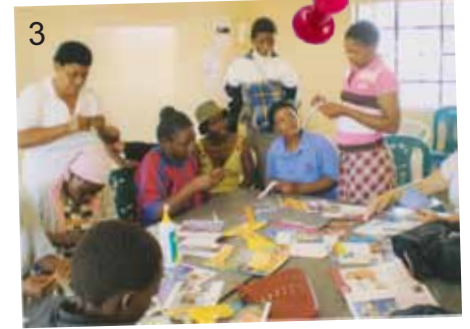
3 A group of village women learning how to make beads from magazines. Later in the process, the beads will be used to create necklaces, bracelets and earrings that the group are then able to sell.