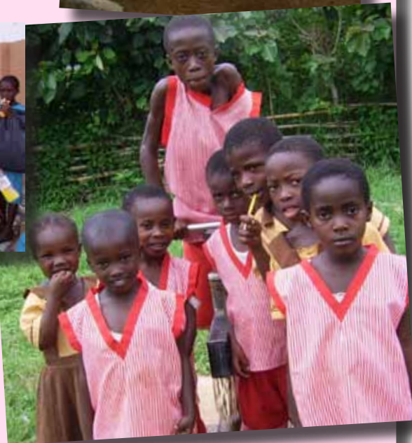
Fresh water from a pump at Domeabra school in Africa