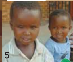
5, 6 and 7. In Sefhare there are three sets of orphaned twins. Each of their mothers died from the AIDS virus. All six of these children have received monthly food rations for the past few years and are healthy today as a result.