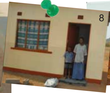
8 and 9 Both of these young mothers are HIV positive and on the HIV treatment program. Each has two children.