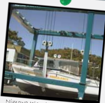
Nimowa Island Ambulance - ready for launch!

Donations are tax deductible and can be made through the Melbourne Overseas Mission.