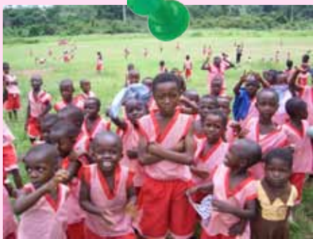
School children in Gambia, seen in class and during their sport's day festivities.