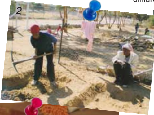
2 Two local women preparing the vegetable garden at the Tonto Day Care Centre for pre-school children.